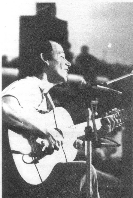
Silvio Rodríguez, street concert Dec. 1980

The Nueva Canción, or New Song, is one of the most significant cultural expressions to emerge from Latin America in recent times, and yet it has never received the attention or the dissemination in this country that it merits. Intimately tied to the political and social struggles that have swept the American Continent in the past two decades, it is still only marginally known in the United States, through a handful of recordings, rare concerts, or the enthusiasm of returning travelers who immediately contrast the depth and vigor of this music to the homogenized and commercial character of much of their own "pop" culture.