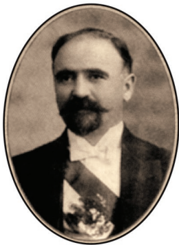
Francisco Ignacio Madero González