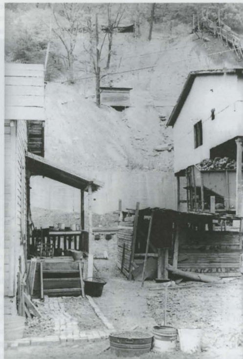
Coal tipple & porch