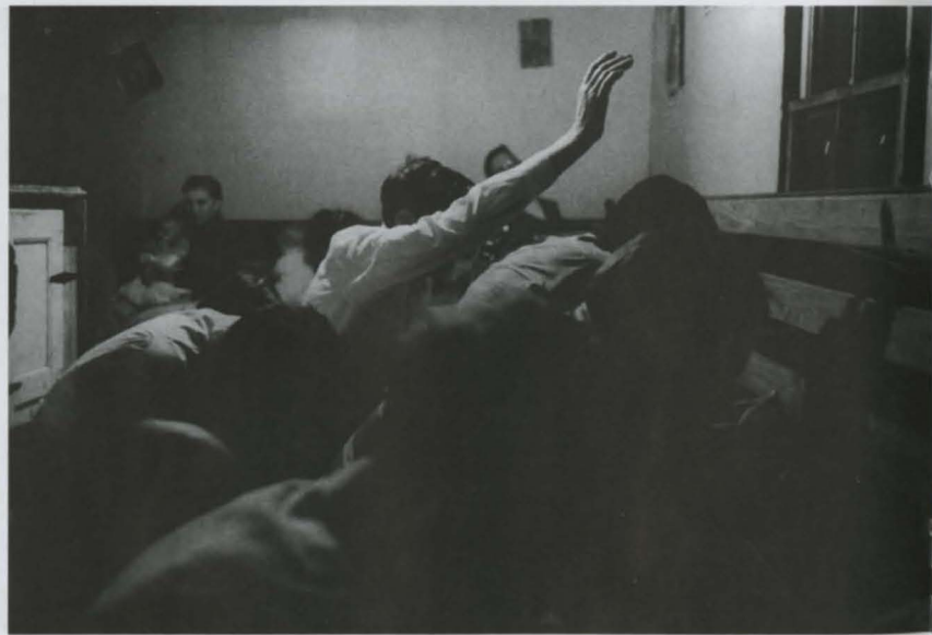
Holiness service, Leatherwood