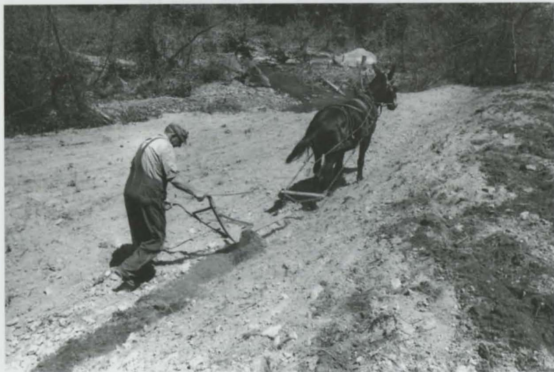
J.B. Cornett plowing with mule