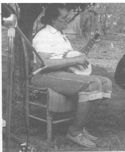
Etta Baker with author's Fairbanks banjo, May 1985.

These song texts also reveal stylistic patterns characteristic of African American song forms. Metaphor and line, rather than plot, juxtapose and accumulate what Jackson (see Jackson in White 1965) has called "images to create a feeling." Lines are often repeated