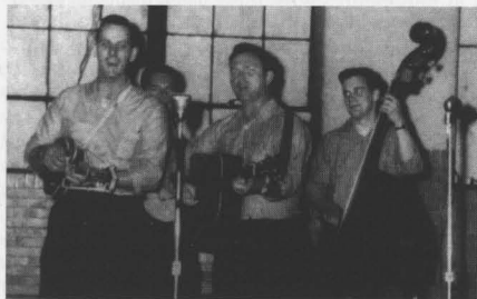
The Country Gentlemen in the early 1960s.