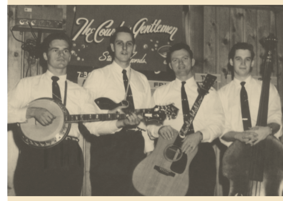
Crossroads Restaurant, Baileys Crossroads, Virginia, 1960 or 1961.