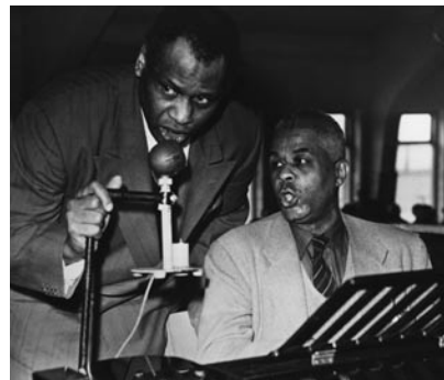
Robeson formed a groundbreaking partnership with accompanist Lawrence Brown in 1925. The duo worked together until the pianist stepped aside due to the threat of violence following the Peekskill, NY mob attacks in 1949.

Despite urging from some white music critics and, ironically, members of the black