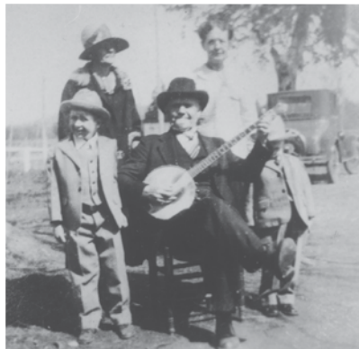
Uncle Dave Macon with family, ca. 1925.