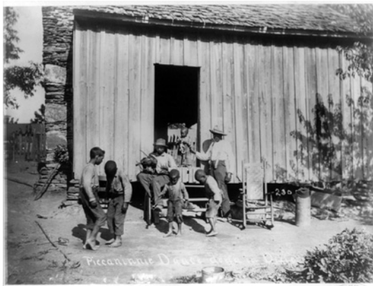
"Piccaninnie dance down in Dixie" 1895, by Russell Brothers, Anniston, Alabama