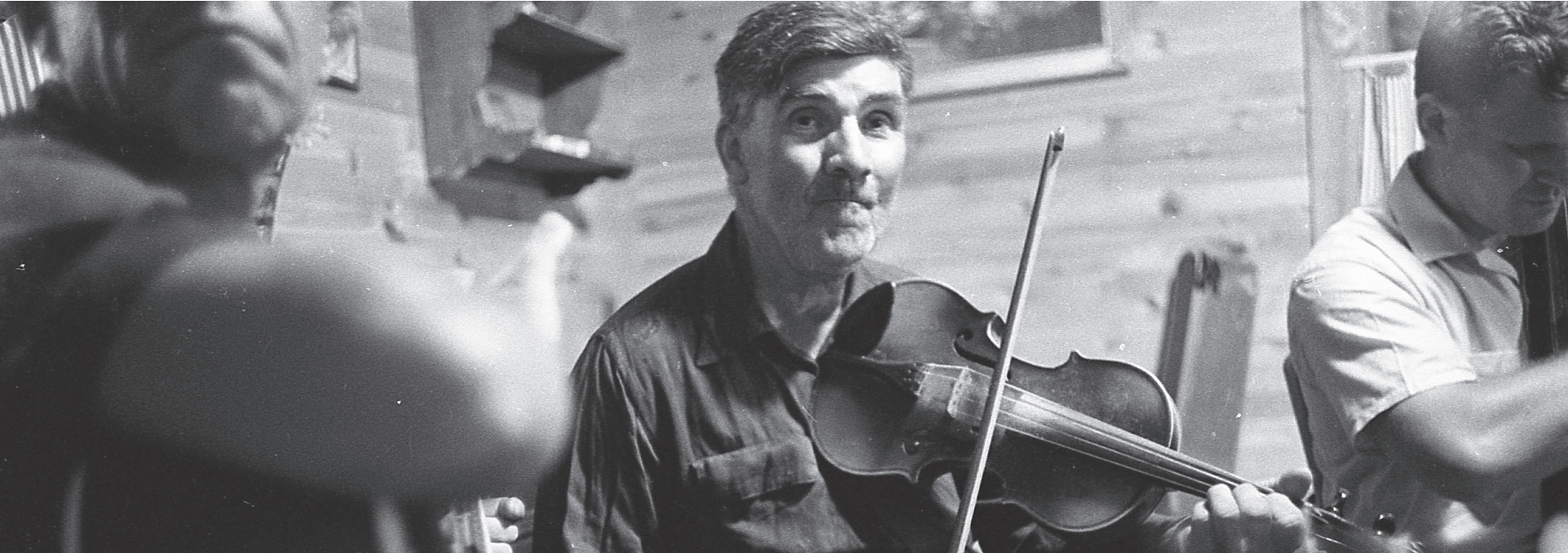
Gaither Carlton, Doc Watson with unidentified guitar player