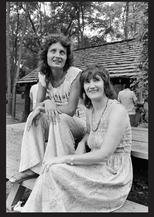
Brandywine Mountain Music Convention, Concordville, PA, July 1974.

(Charlie Louvin-Ira Louvin/Sony/ATV Acuff Rose Music, BMI)