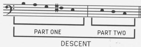
Fig. 3. Melodic composition of vocal subsections

Descents may be classified into those including a statement of the Main Text, and those including only vocable material. In "Main Text