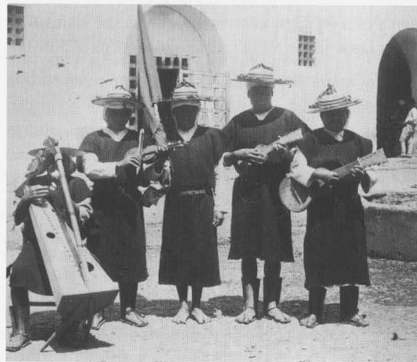
Tzotzil musicians , ca. 1900. Chamula, Chiapas, Mexico. (N17142)

The violin is often pointed to as clear evidence of European cultural influence in American Indian cultures. Indeed, the instrument's widespread acceptance is testimony to the special attraction of the European violin in early colonial times, considering that, apart from the musical bow, chordophones were virtually non-existent in pre-Columbian life. When viewed more closely and within this broader musical and cultural context, however, the Indian violin's construction, the manner in which it is played, its repertoire, and the cultural significance of the performance context of which it is a part more often point to the contrary—the persistence of Native culture in the midst of a politically and