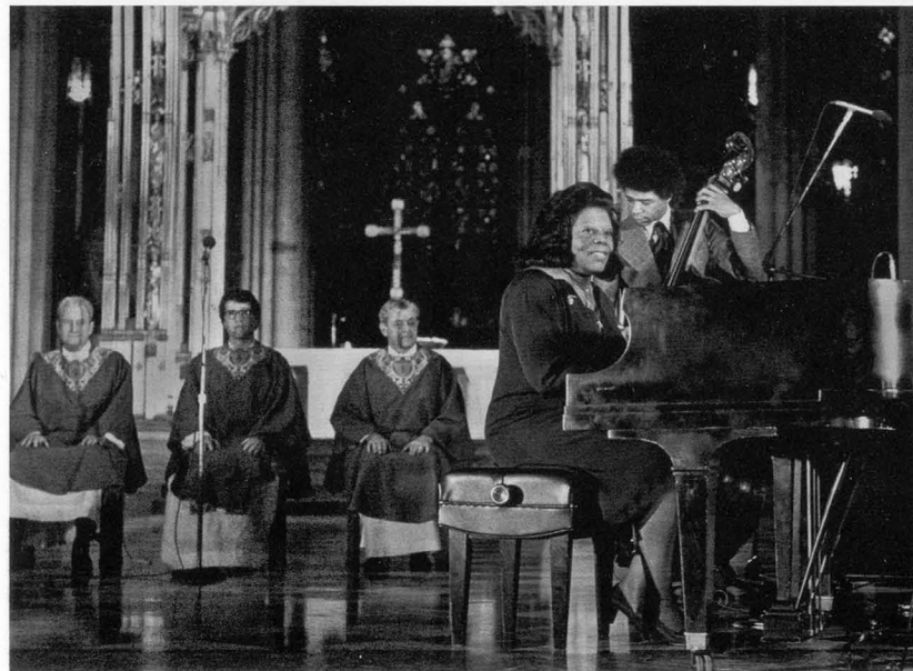
Mary Lou Williams at the piano with Buster Williams on bass during the celebration of Mass at St. Patrick's Cathedral, New York City, on Feb 18, 1975.