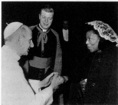
Mary Lou Williams received by Pope Paul VI at the Vatican in 1969.