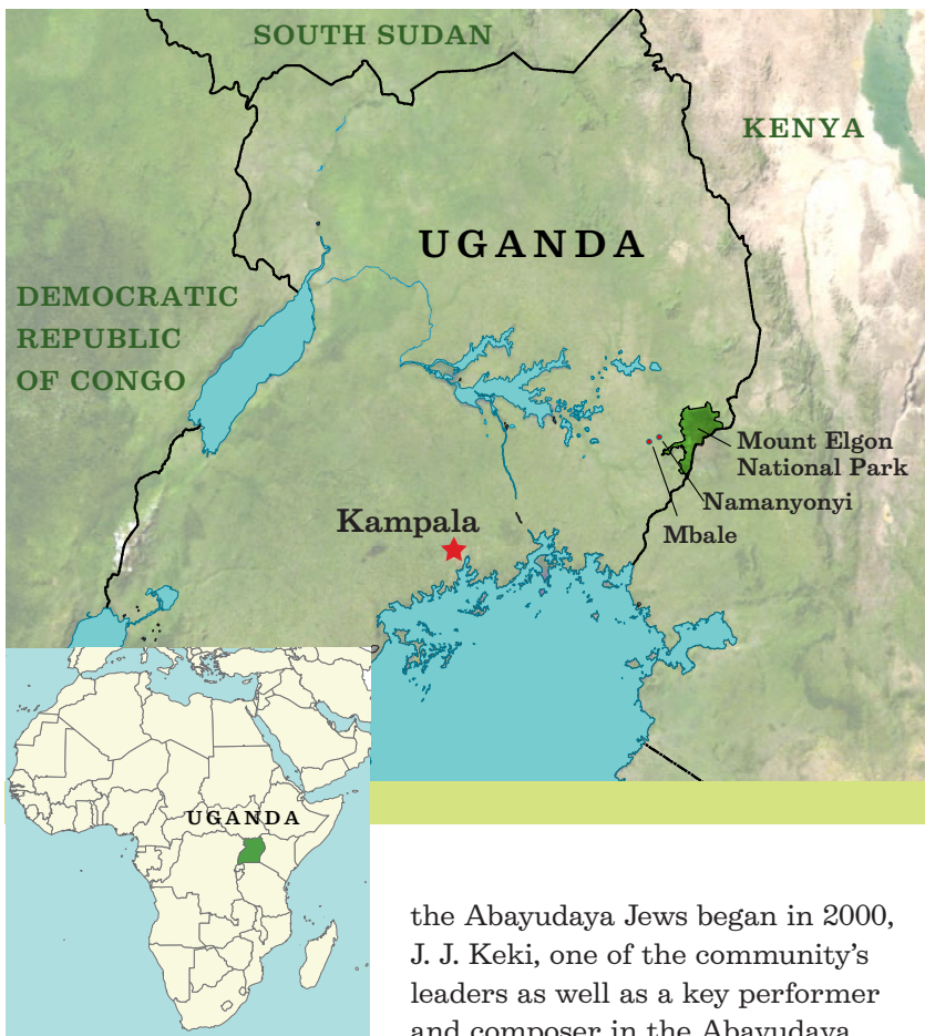
Map of Mbale, Uganda.