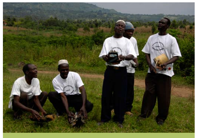
Akuseka Takuwa Kongo Group.

My fellow Ugandans, let me tell you about the benefits of coffee: Coffee is medicine. Even when you are sick with malaria, friends, you take caffeine. My friends, coffee is a valuable drink.