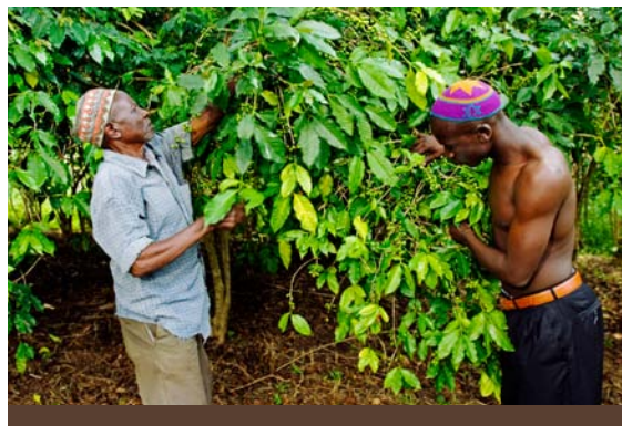
far right: Sorting coffee cherries.