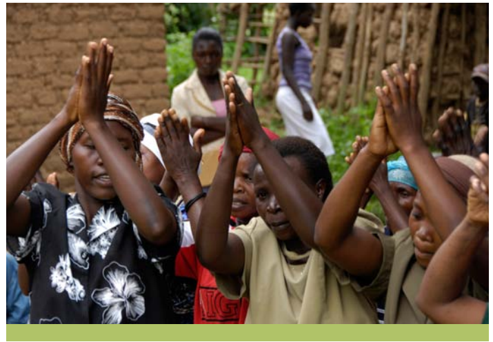
left: Mbiko Aisa Farmers Group.