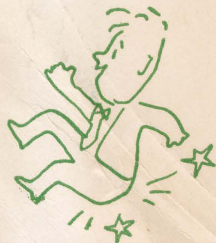
SALLY GO ROUND